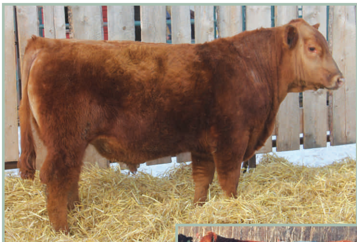
RED RIVERSIDE EYE SPY 17G LOT 22

RED MAPLE RIDGE ACRE EUGENIE DAM OF LOT 22