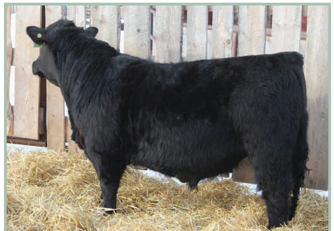
RIVERSIDE UPWARD 23G - LOT 8

A real favorite in the Upward Sire Group, who has mass, thickness and depth packed into a moderate frame.