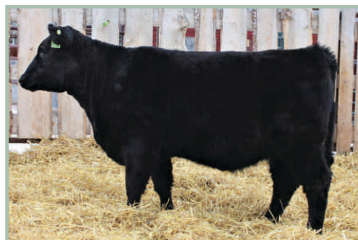
RIVERSIDE ERICA128G - LOT 26

PAPA FORTE 1921 WOODHILL FORESIGHT BON VIEW GAMMER 85 S: SOUTH SHADOW FORESIGHT 85B CUDLOBE RAINMAKER 39K SOUTH SHADOW RUBY 12N SOUTH SHADOW RUBY 63L S A V NET WORTH 4200 MVF NET WORTH 134T MVF TIBBIE 110P D: RIVERSIDE ERICA 28Z LORENZ DATELINE 16P RIVERSIDE ERICA 7T R.F. ERICA 12M