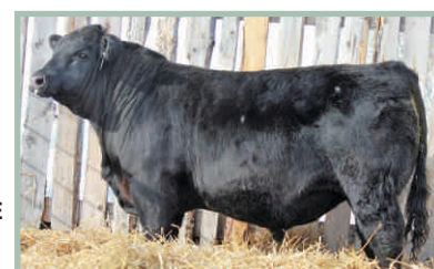
RIVERSIDE ACTIVE DUTY 762E SIRE OF LOT 32

Lots of Maternal strength in the pedigree of TCS 74G, her dam has a full brother in the sale.