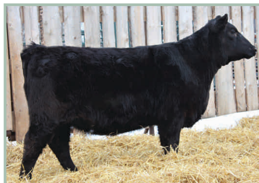
RIVERSIDE ELLA 259G - LOT 28

This Foresight heifer is from another top cow family at Riverside, her dams Net Worth sister is doing amazing things for us two high selling bulls through our sale and this past fall her Consensus daughter placed 3rd overall in the intermediate heifer calf class.