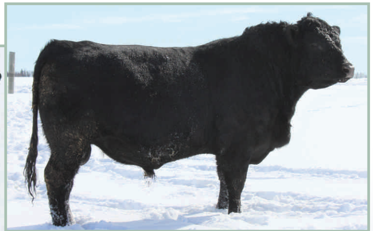
RIVERSIDE FORESIGHT 80F - LOT 25

A very complete bull, with style and eye appeal.