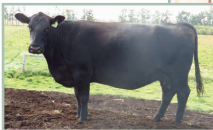
RIVERSIDE ERICA 63A DAM OF LOT 10