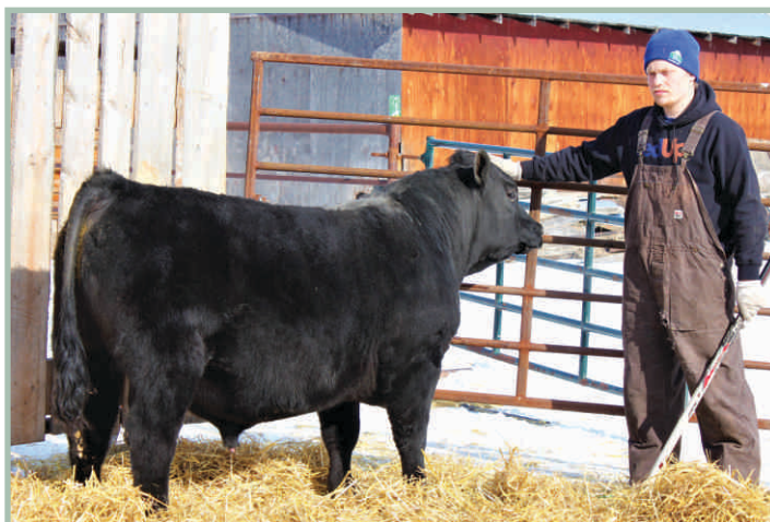
RIVERSIDE UPWARD 63G LOT 10 (BOTH PICS)