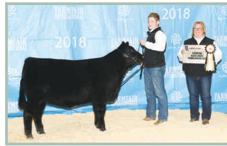
RIVERSIDE PRIDELLA 253F FULL SISTER TO LOT 4

A full brother to the 2018 Champion Spring heifer calf at FarmFair. This bull has natural thickness throughout, will and style and pounds to your calf crop.