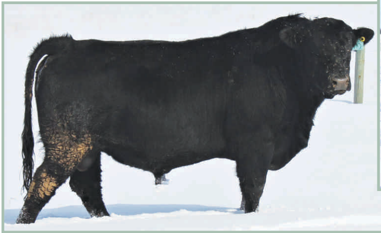
RIVERSIDE FORESIGHT 10F - LOT 24

A thick wide topped Foresight son. His Dam has produced several hard-working females in our herd including the dam of TTS 80F and dam to our other 2year old on offer.