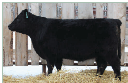
RIVERSIDE BLACKCAP 44G - LOT 27

PAPA FORTE 1921 WOODHILL FORESIGHT BON VIEW GAMMER 85 S: SOUTH SHADOW FORESIGHT 85B CUDLOBE RAINMAKER 39K SOUTH SHADOW RUBY 12N SOUTH SHADOW RUBY 63L LORENZ EQUALIZER 5S RIVERSIDE EQUALIZER 3W RIVERSIDE DATELINE BELLE 3S D: RIVERSIDE BLACKCAP 44Y LORENZ DATELINE 16P RIVERSIDE BLACKCAP 24W RIVERCREST BLACKCAP CSP 21K