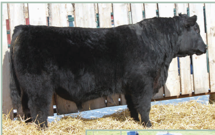
RIVERSIDE UPWARD 18G LOT 14