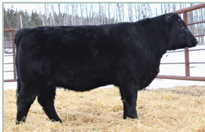
RIVERSIDE DIVERSITY 81G - LOT 32

We calved our 1st Absolute daughters this spring they have excellent dispositions, excellent udders they are all proving to be hard working mama cows.