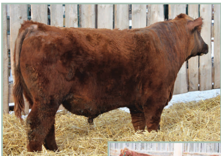
RED RIVERSIDE STRONGBAR 27G LOT 23