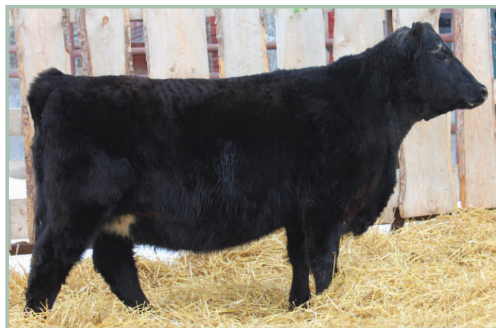
RIVERSIDE TIBBIE 61G - LOT 30