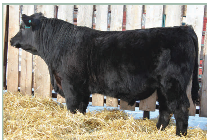
RIVERSIDE FORESIGHT 72G - LOT 20

129G is a Foresight son with extra length, neck extension and an attractive muscle pattern. We have 2 sisters in the herd and they are beautiful heifers easy to handle.