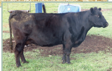
RIVERSIDE INA 18U DAM OF LOT 14